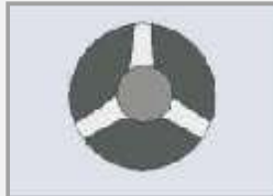
Solid Brass Rod