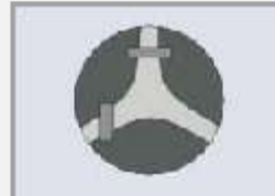
Solid Copper Strips