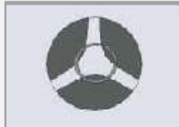
Hollow Copper Tube

Application examples for removing broken Taps and screws using appropriate circular / flat Electrode