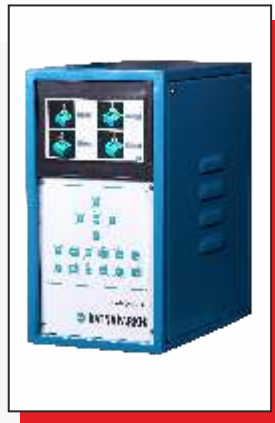
Orbital Control Unit