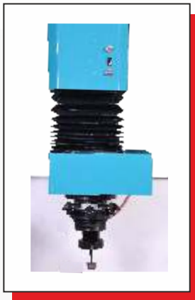
Orbital Mechanical Unit